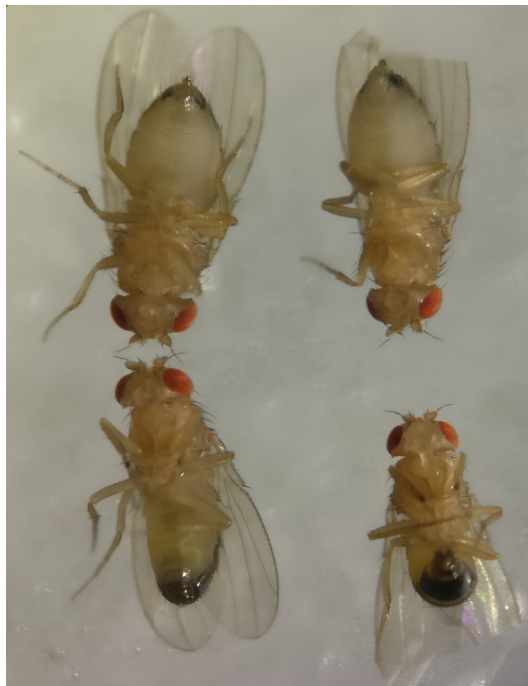
Figure 2. Adult morphology of Drosophila melanogaster . Clockwise from top left: Non-wing clipped adult female, Wing clipped adult female, Wing clipped adult male, Non-wing clipped adult female.