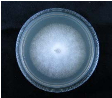
Figure 1. P. sojae colony grown on V8 plates for 4 days