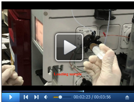
Video 1. Gel filtration desalting chromatography for separating the precipitated proteins by AKTA