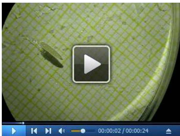
Video 1. Video of a wildtypic third instar larva. The video depicts a successful recording of