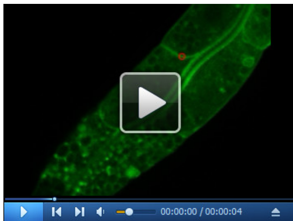
Video 1. Illustration of FRAP. The first twenty cycles of the FRAP experiment. Red circle of 7-pixel radius is the bleaching region.