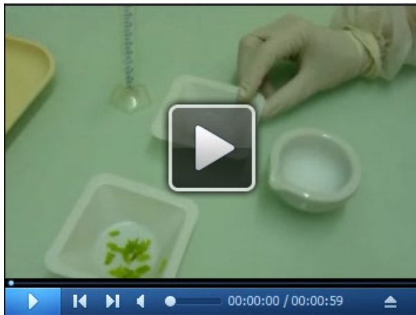
Video 1. Preparation of RYMV inoculum from infected rice leaves