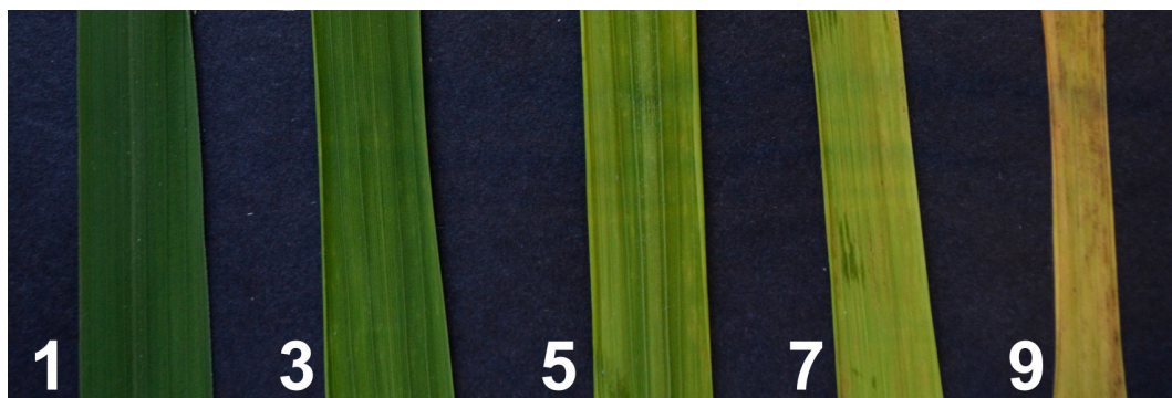
Figure 2. Symptom severity scale on rice leaves