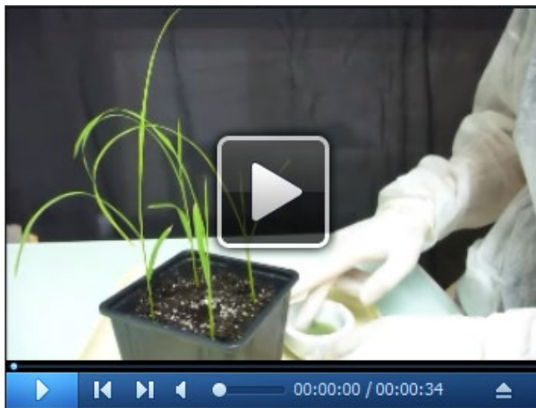
Video 2. Mechanical inoculation of RYMV on rice leaves