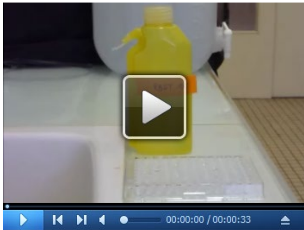
Video 3. DAS-ELISA plate washing

Discard the coating solution from the wells. Wash the plate by filling the wells with 1x PBST using a wash bottle and decant the washing buffer immediately (for a quick wash) or after 3 min. Proceed successively to a quick wash and three 3 min-washes. Remove residual buffer on a paper towel (Video 3).