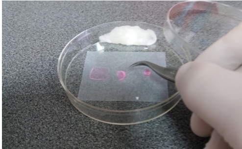
Figure 2. Humid chamber

cotton wool is placed near the dish wall. Drops of a dye solution are placed on the Parafilm, cover slips are placed on these drops (sections downwards) (Figure 2). The dishes are sealed with the Parafilm.