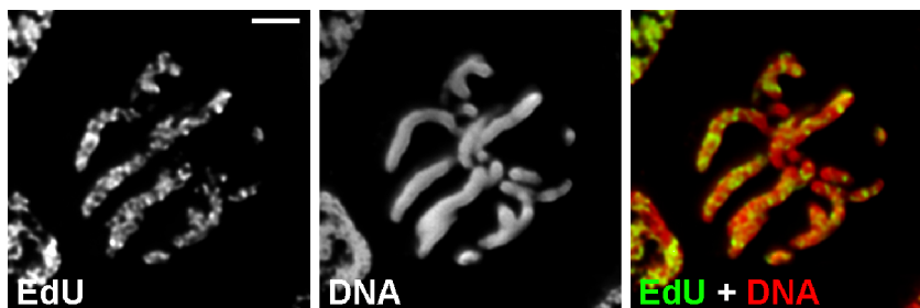
Figure 3. Chromosome labeling with EdU. Metaphase cell of Nigella damascena L. whose chromosomes included EdU during late S-phase. Wild-field fluorescent microscopy with 3D-deconvolution. Scale bar = 5 µm.