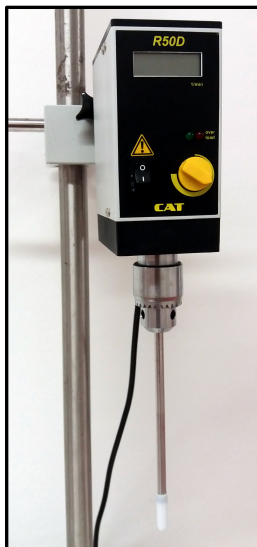
Figure 2. Motor-driven homogenizer

Note: Our lab uses one brain hemisphere with cerebellum and olfactory bulb removed and flash frozen on a plate of dry ice. We do not remove the meninges upon harvesting the tissue.