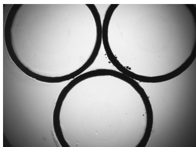
Figure 1. A representative image of a copper ring embedded agar plate. Three copper rings are placed on a 60 mm NGM agar plate, and 10 µl of OP50 is added at the center of the ring.