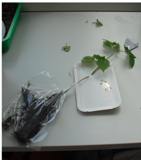
Figure 3. Plants are cut 5-10 cm above ground with a scalpel or blade