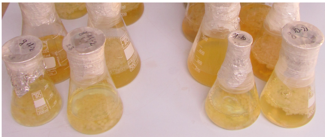
Figure 2. A picture of fungal culture grown after 5 days. White fungal mycelium in a sphere shape can be seen. Medium with fungal isolates that produce a lot of spores is duller.