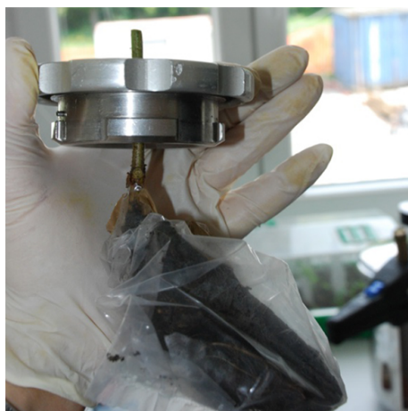
Figure 5. Metal cover of Scholander pressure cylinder with cut plant stem. The plant stem is placed through the upper part of the Scholander pressure cylinder.