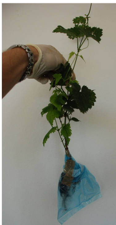
Figure 4. The root is placed in a plastic bag