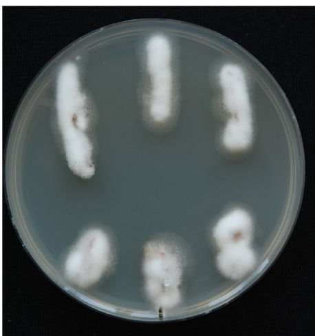
Figure 8. Fungal outgrowth from xylem sections after 3-5 days. White and fluffy mycelium is typical of V. nonalfalfae . Fungal mycelia prefer to grow on the plant material (xylem sections are completely overgrown by mycelium) and not on the PDA medium.