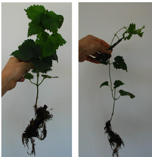
Figure 1. Example of stems of hop plants, cultivar Celeia. Left – strong, thick stem. Right – weak, thin stem.