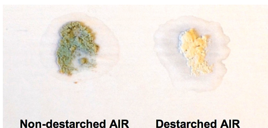
Figure 2. Image of non-destarched and destarched AIR following staining with Lugol's Iodine solution