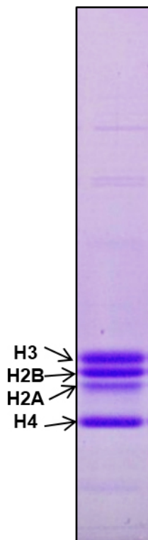
Figure 1. Purification of core histones. Core histones were purified from chicken brain tissue through hydroxyapatite resin and the purity was checked by running 18% SDS-PAGE. 2 µg core histones were loaded onto a lane.

Check purity of core histones by running 18% SDS PAGE as shown in Figure1.