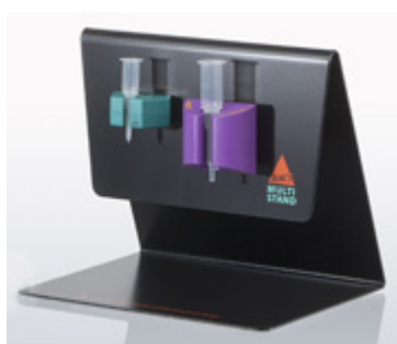
Figure 1. MACS midi system for cell purification