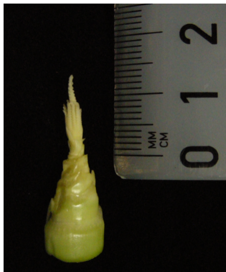
Figure 2. Immature maize tassel at time point of EdU treatment