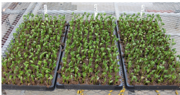
Figure 1. Soybean (William 82) seedlings 7 days after planting