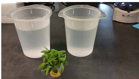
Figure 4. The plantlets are washed with RO water to remove the Agrobacterium

Note: Do not use regular tap water or any water that may contain chlorine, fluorides, or any other water purifying reagent. Fill enough 1 L beakers the night before the post co-cultivation wash to wash all of the plants. This allows RO water to equilibrate to room temperature. Air condition the lab if necessary.