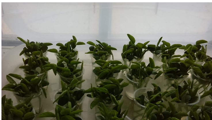
Figure 3. The plantlets are placed inside of a clear plastic tub for co cultivation