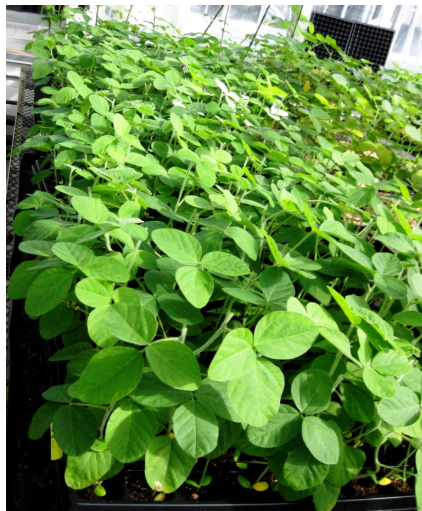
Figure 5. Soybean plants are in the greenhouse and growing well 38 days after transformation