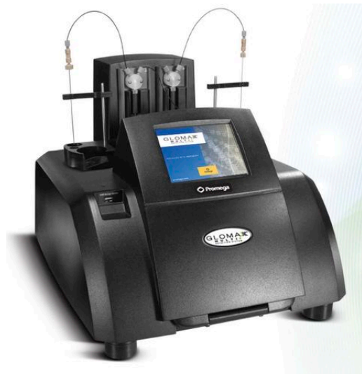
Figure 2. GloMax®-Multi+ Detection System with dual injectors. For a video about how to use the GloMax click on the following link: https://ita.promega.com/resources/multimedia/instruments/features-glomax-multi/ . For the manufacturer's manual click on the following link: https://www.promega.com/~media/files/resources/protocols/technical_manuals/0/glomax-multi_detection_system_protocol.pdf .