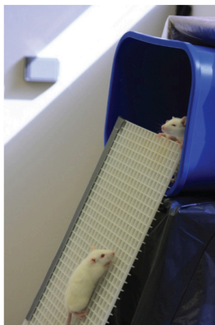
Figure 2. Wire mesh ascending test