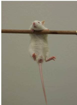
Figure 1. Bar holding test