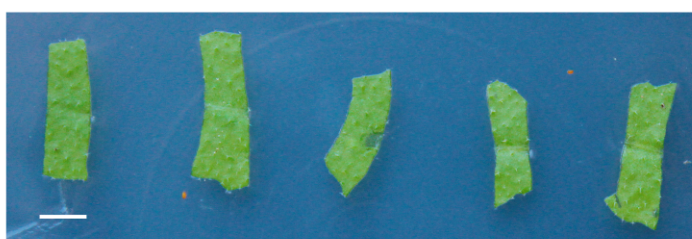
Figure 2. Arabidopsis leaf strips. Bar = 3 mm.