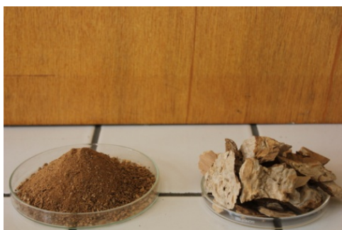
Figure 1. Bark of Rauvolfia nukuhivensis after and before the grinding process