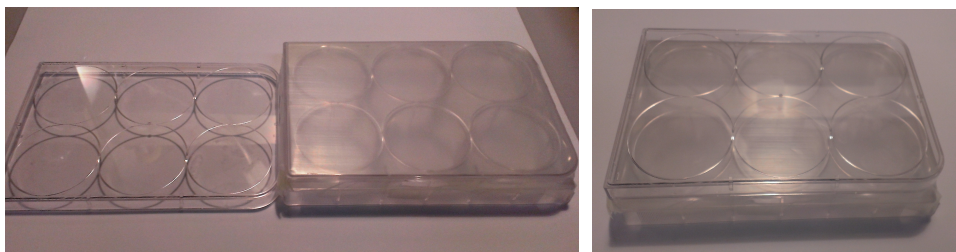
Figure 1. The chamber for incubation. The 6-well plate was covered with a piece of parafilm to support the coverslip with cells, and another lid was used to prevent sample drying. The chamber is designed to be incubated in a tissue culture incubator at 37 °C for