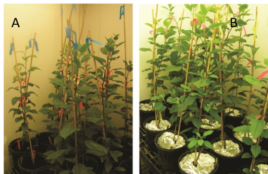
Figure 2. Typical water deficit experiment in the growth chambers

Apple trees ~ 1 m tall were selected, tagged and placed in the Conviron growth chamber. The figure shows trees with and without foil placed on the pots. Red tags represent water deficit treatment; blue tags represent well-watered controls. A. Water deficit treatment and controls without foil; B. Water deficit treatment with foil covering pot surface.