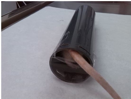
Figure 2. Picture of the tube with tape and animal inside