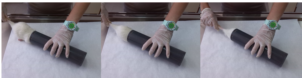
Figure 3. Pictures showing the restraint procedure using a plastic tube