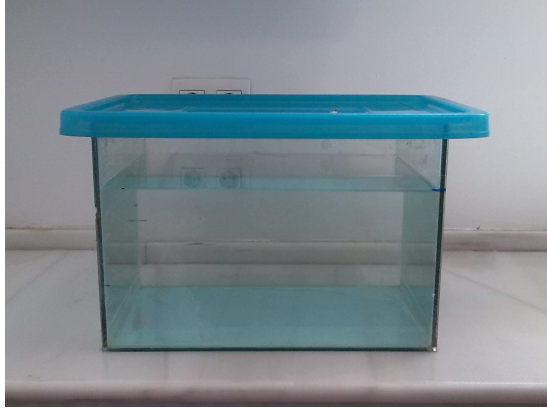
Figure 1. Picture of a typical glass tank filled with cold water