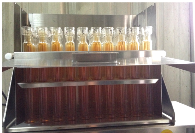
Figure 2. The digestion state of standard tea material samples