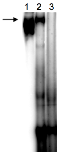
Figure 2. Scanned image of native PAGE gel after binding assay. This is an example of the separation of unbound, small tRNA* at the bottom of the gel and the tRNA* bound to the much bigger T-box RNA (arrow), which was transcribed in vitro in the presence of pre-formed, radiolabelled(*) tRNA. lane 1: control IVT reaction of T-box RNA* without tRNA; lane 2: T-box RNA IVT with tRNA*fMet; lane 3: T-box RNA IVT with tRNA*Cys (not binding to T-box RNA).